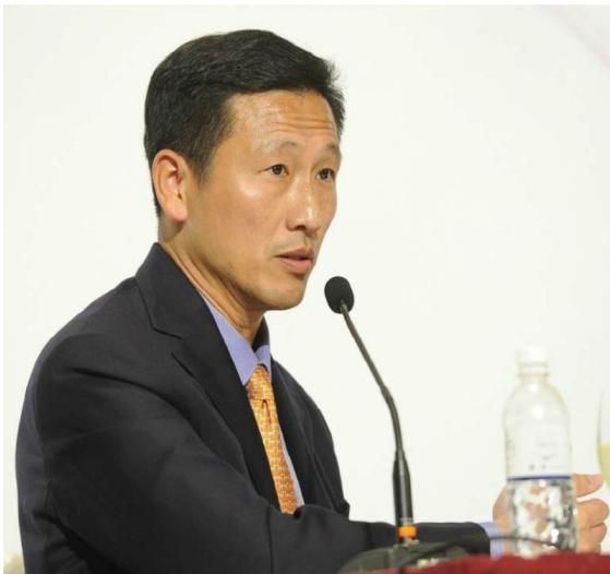
Mr Ong Ye Kung

Minister for Education (Higher Education & Skills)