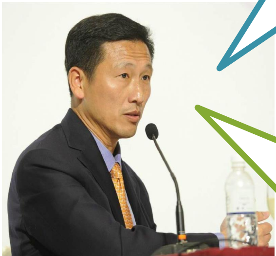
Mr Ong Ye Kung Minister for Education (Higher Education & Skills) Committee of Supply Debates

For those who are clear what they want to pursue, we should support them as much as possible, to facilitate their admission into our PSEIs based on interests and aptitudes, and not solely based on academic results.